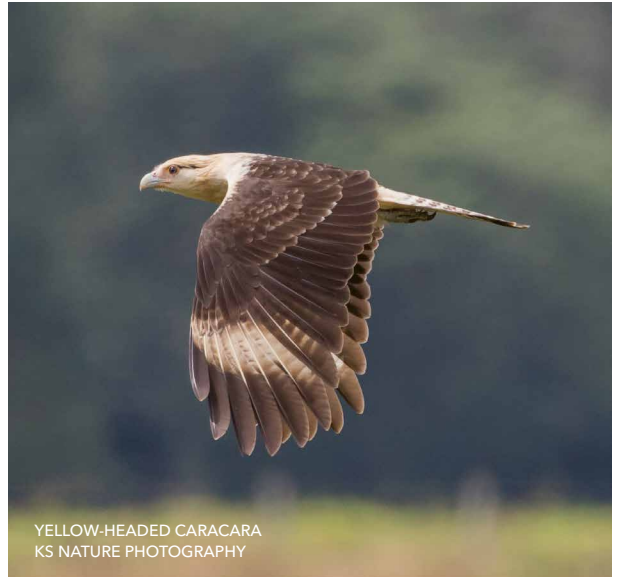
YELLOW-HEADED CARACARA KS NATURE PHOTOGRAPHY