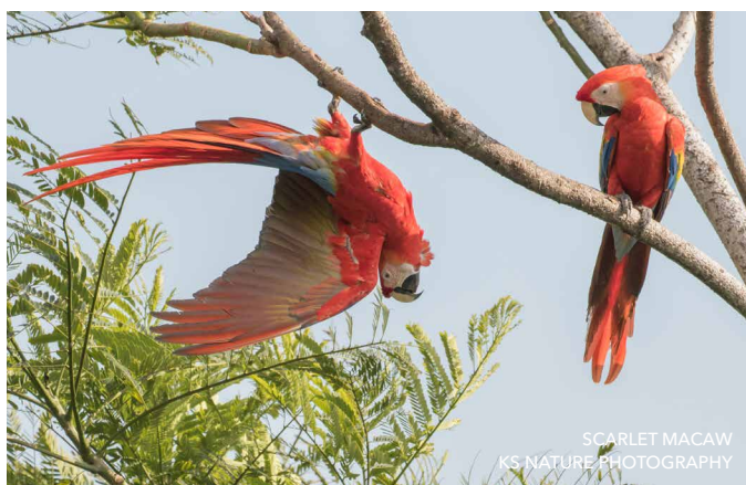
SCARLET MACAW KS NATURE PHOTOGRAPHY

This morning you will be transferred to the international airport for your flight home. Flights should depart no earlier than 2:00 pm. (B)