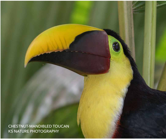
CHESTNUT-MANDIBLED TOUCAN