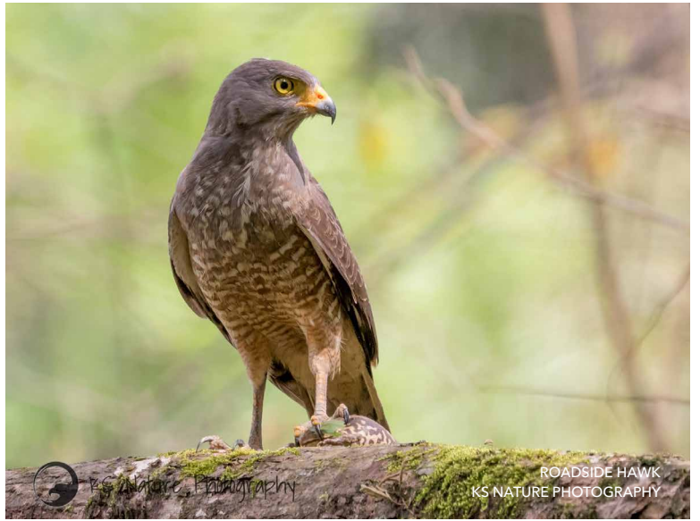
ROADSIDE HAWK KS NATURE PHOTOGRAPHY