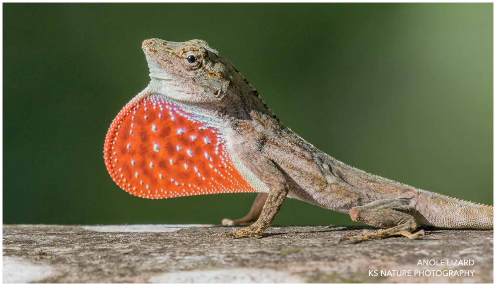
ANOLE LIZARD KS NATURE PHOTOGRAPHY