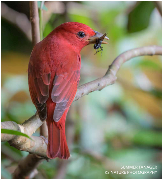
SUMMER TANAGER KS NATURE PHOTOGRAPHY